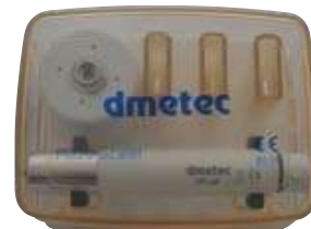
• Autoclave box