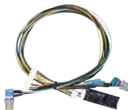
• Hanes cable