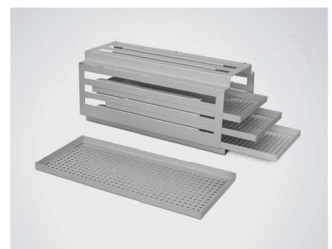
Optimization and time reduction