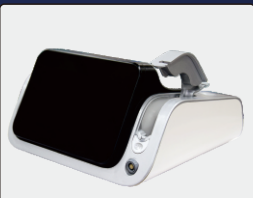
water injection pipe fixture