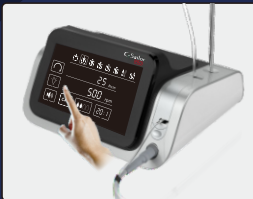
- Full touch big screen