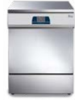
Tethys T60 - Tethys D60