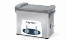
Highea 3 WASHING