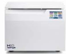
Tethys H10 plus THERMAL-DISINFECTION