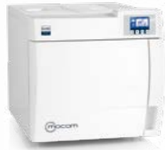
B Classic STERILIZERS