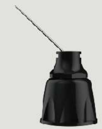
23 Gauge Large