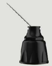
25 Gauge Small