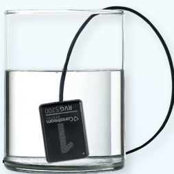
Waterproof & fully submersible for optional infection control