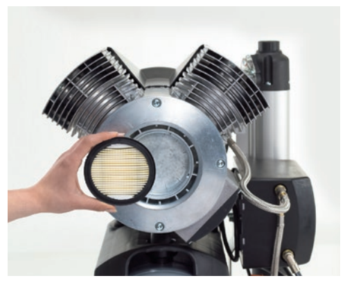
Easy change of central intake filter for worry-free operation and long service life.

Clean air, uncontaminated by water, oil or particulates, is an important hygiene factor in dental treatment. It also maintains the value of your compressor and instruments.