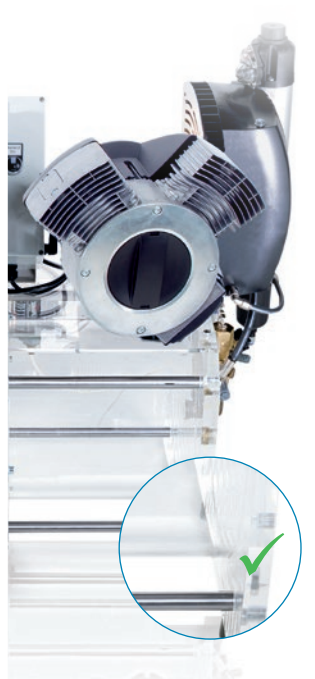
Oil-free Tornado – compressor with a membrane drying unit

Clean air, uncontaminated by water, oil or particulates, is an important hygiene factor in dental treatment. It also maintains the value of your compressor and instruments.