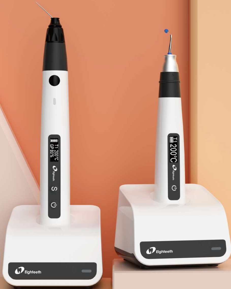
Fast-Pack pro & Fast-Fill